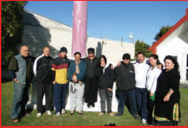
taatou Nгаа Rauru Kiitahitanga.

Noo te tau 2011 te urupounamu i puea ake hei take koorero maa teetehi ohu kaimahi. Ko taua urupounamu raa, “Me peewhea taatou e whakawhanake ai i a taatou tonu?” He torutoru noa ngaa taangata e waha ana i ngaa kaupapa nunui o kaainga ka tahi. He nui noa atu ngaa taangata o waho e kaha tirohia ana e aha ana te Iwi ki te kaainga ka rua. Naa ka koorero atu, ka koorero mai te ohu kaimahi nei ka roa. Nawhaiaa ka puta teetehi pakiaka e kiiia nei “Me whakatuu waananga whaikooreo – karanga kia ora ai oo taatou paepae o te kaainga”. Me te tumanako ia ka ora oo taatou paa i eenei hunga e manawa popore ana ki too